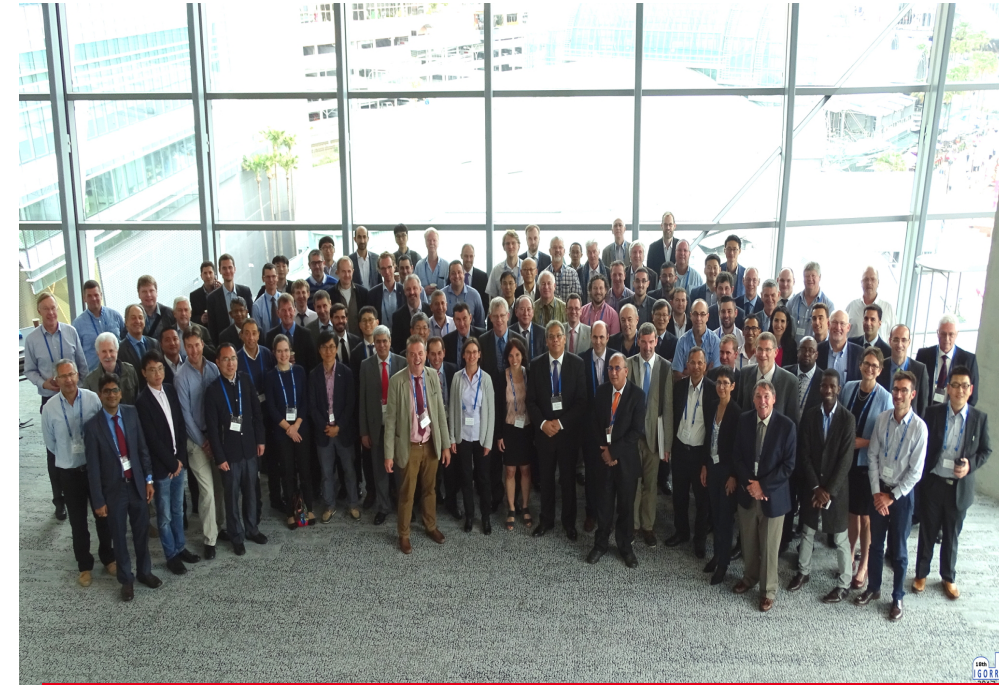
IGORR Conference Dec 2017 Sydney